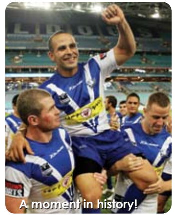
Sunday Telegraph Cover 15th March 2009