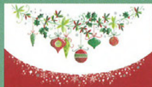
BA197 Silver Foil Festive Decorations