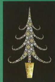
TR148 Gold Foil Majestic Tree