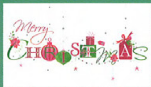
FE151 Silver Foil Merry Christmas