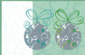
BA034 Silver Foil Jazzy Baubles