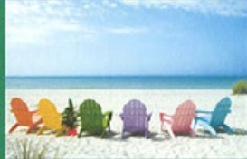
FE010 Beach Christmas