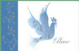
DO171 Silver Foil Dove Of Peace