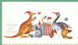
AU142 Gold Foil Aussie Christmas