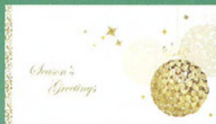
BA092 Gold Foil Golden Bauble