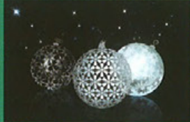
BA081 Silver Foil Elegant Baubles