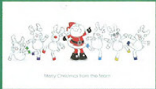
FE078 Silver Foil From The Team