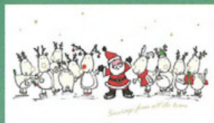
FE960 Gold Foil Santa's Team