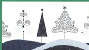
TR075 Silver Foil Spiral Trees