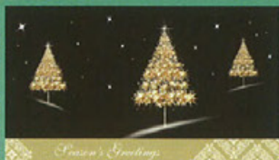
TR037 Gold Foil Shimmering Tree