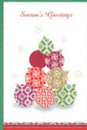
BA101 Gold Foil Tree Of Baubles