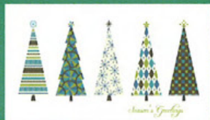
TR175 Silver Foil Stylish Trees