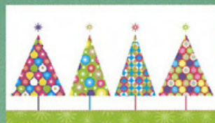
TR044 Gold Foil Colourful Trees