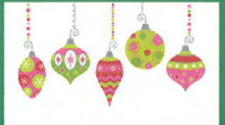
BA104 Silver Foil Colourful Baubles