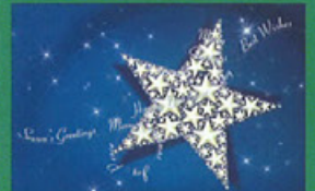
ST028 Silver Foil Shooting Star