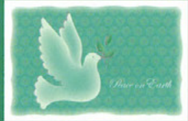
DO142 Silver Foil Delicate Dove