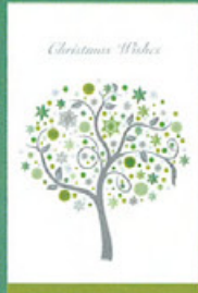
TR117 Silver Foil Gorgeous Tree