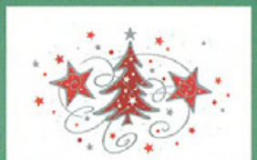
TR067 Silver Foil Twinkling Tree