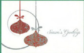
BA181 Silver Foil Contemporary Baubles