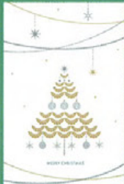
TR179 Silver Foil & Gold Foil Elegant Tree