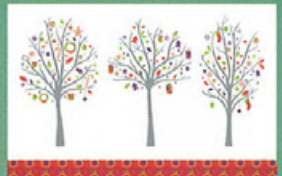
TR192 Silver Foil Delicate Trees